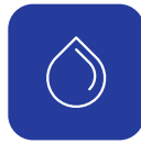
Environmental IP tests