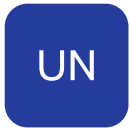
UN 38.3 transport tests

We provide a thorough testing service in our modern and well-equipped testing laboratory, where we carry out periodic quality assurance testing for complex products. Tests we regularly carry out include: